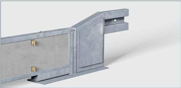
Transition to stationary crash barrier